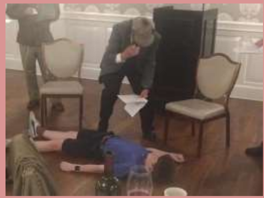
Holmes inspects the body as Watson looks on