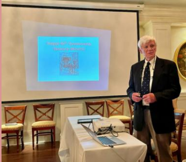
The Tantalus starts the slideshow