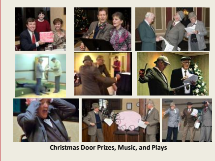
Christmas Door Prizes, Music, and Plays