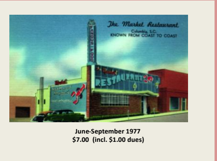
June-September 1977 $7.00 (incl. $1.00 dues)